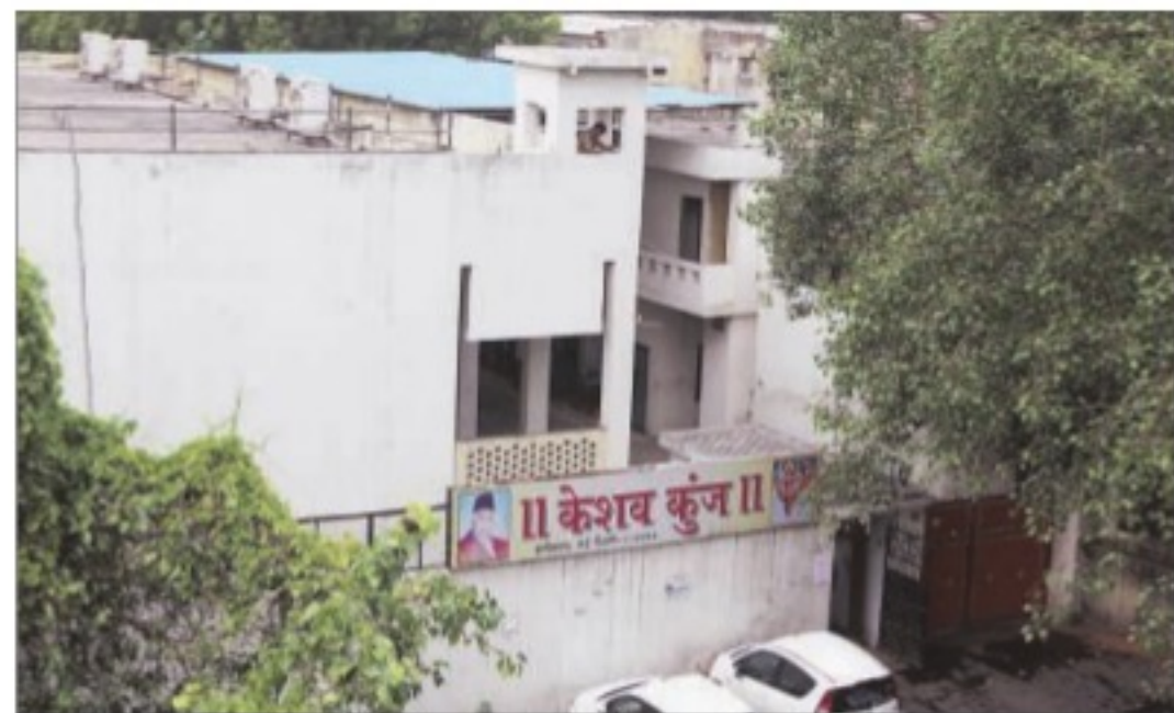
Sangh had sensed defeat based on workers' feedback

The sources said confirmation of that trend came from