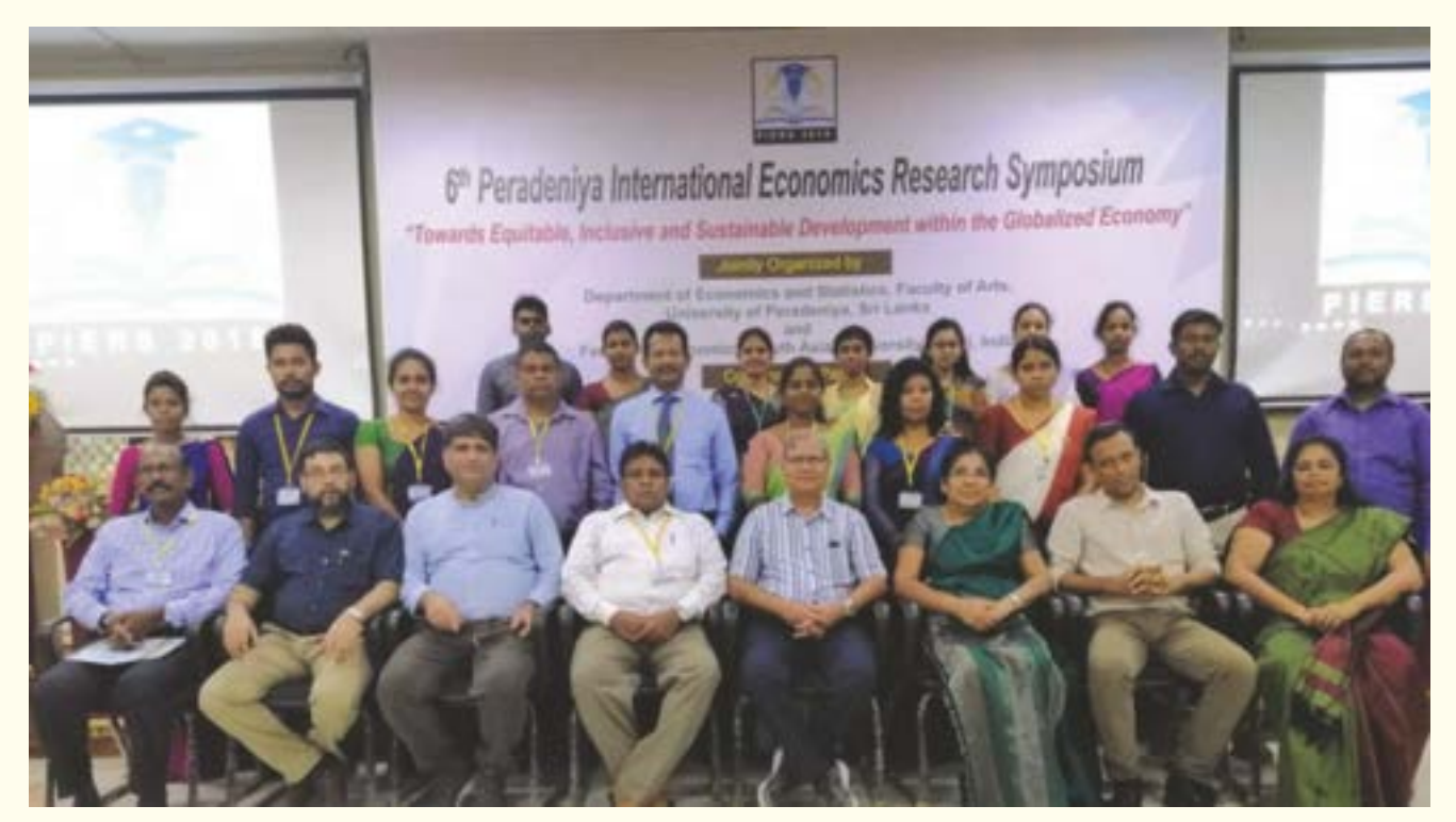
Organisers and Participants at the 6<sup>th</sup> Peradeniya International Research Symposium held on 8 - 9 November 2018, Sri Lanka, jointly organized by Faculty of Economics, South Asian University, and University of Peradeniya, Sri Lanka

Dept. of Economics, Calcutta University on 14-15 February 2018