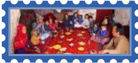
Afghanistan – Communities celebrate Eid with prayers, family gatherings, and festive meals, embracing the spirit of renewal and togetherness.

March across South Asia is a celebration of colours and renewal, as the muted tones of winter fade and new flowers bloom, painting the landscape with vibrant hues. The season comes alive with festivities that reflect cultural diversity, spiritual devotion, and communal joy.