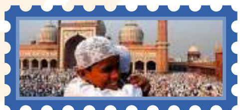
Pakistan – Eid is marked by colourful attire, festive prayers, family feasts, and community celebrations.