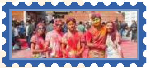
Nepal – Devotees celebrate Holi with vibrant powders, communal merriment, and music, welcoming the seasonal bloom.