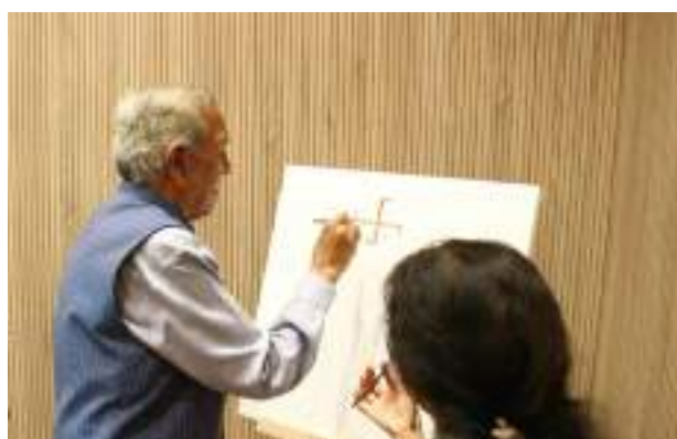
Art Camp 2026 on “Visual Delights in SAARC Nations”