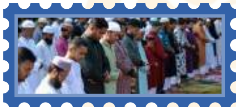
Bangladesh – Streets come alive with Eid celebrations and colourful springtime events, as families share meals and participate in cultural festivities.