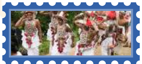
Sri Lanka – Spring observances and Medin Poya feature processions, traditional dances, and colourful rituals, embracing spiritual and cultural traditions.