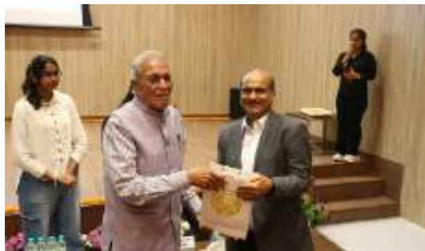
Public Awareness Lecture on “Hernia – Myths and Facts” under Medical Series