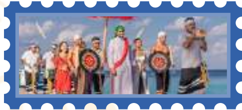
Maldives – Eid brings families together with prayers, evening feasts, and communal celebrations, adding colour to island life.