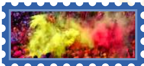
India – Holi , the festival of colours, fills communities with powders, water, music, and dance, symbolizing joy, unity, and new beginnings.